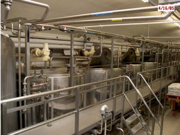
Installation of four new process vessels