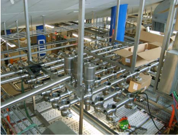
Installation of a manifold