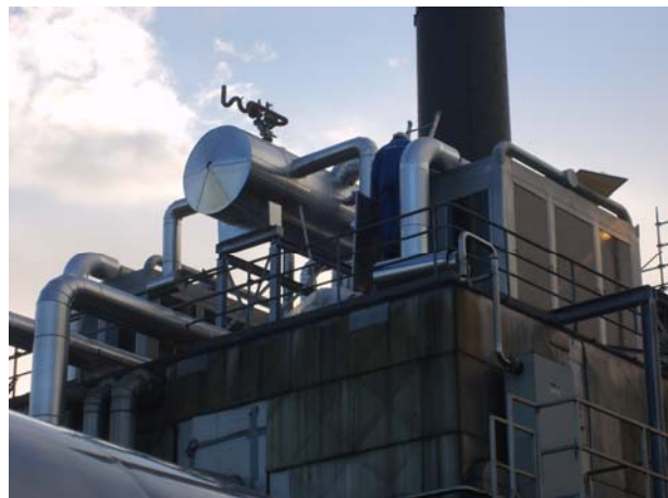
The new ice water installation is based on the "falling film" principle.