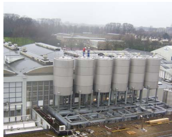
The building of a steel construction suitable for a total weight load of 1000 ton.