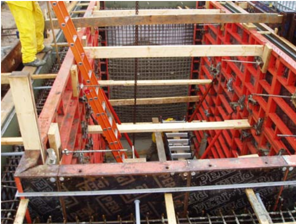
The building of a pump pit for a waste water installation.