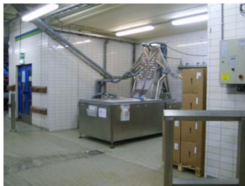
Installation of capper applicators.