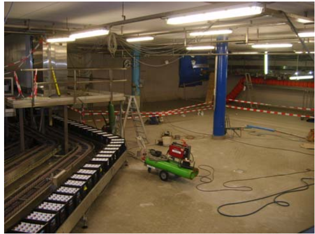
The increasing of a filling department during normal production.