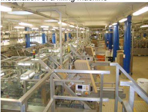
Installation of several wrap-arounds.