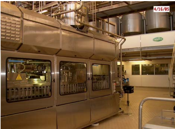
Installation of a filling machine