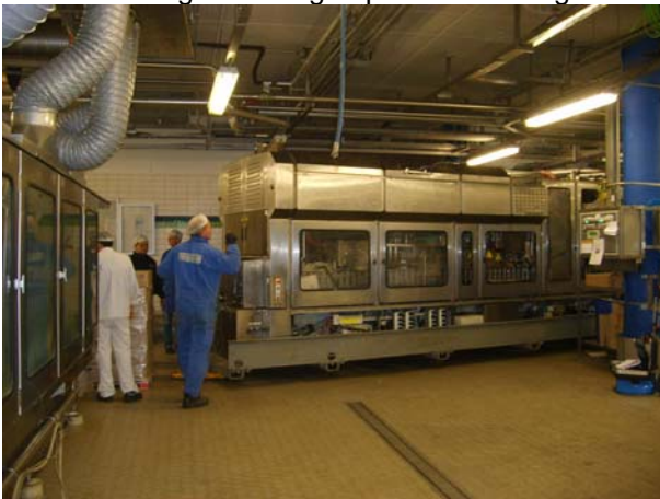
Installation of a filling machine